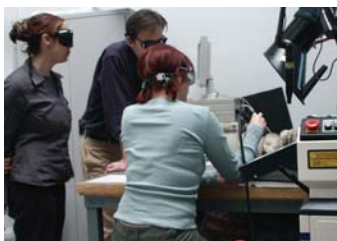
Laser cleaning training