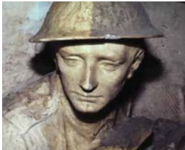
Plaster model of Goscombe Johns War Memorial Port Sunlight, during laser cleaning.

Conservation Technologies has combined many years of experience in the field of sculpture and monuments conservation and has undertaken diverse range of conservation projects.