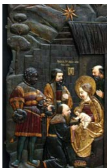
Conserved polychrome wooden German 16th Century relief

We conserve sculptures made from a very broad range of materials: inorganic (stone, metal, terracotta and plaster) and organic (wood, ivory, and some plastic). These sculptures may also be of composite nature and have a polychrome surface. Having an appreciation of the historical and aesthetic aspects of sculpture, together with an understanding of the material conservation issues, is vital to our working process.