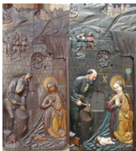
18th Century wooden panel before and after conservation treatments

Conservation Technologies is at the cutting edge of the conservation industry and has pioneered the development of technologies to care for items and artefacts from all historical periods including Egyptian, medieval, archaeological and Victorian to the present day.