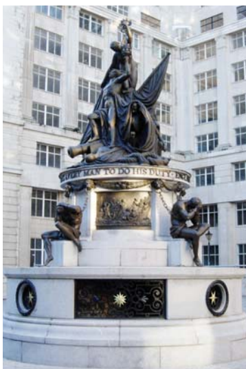
Bronze Monument after conservation, to commemorate Nelson's victories (2005)