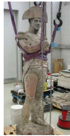
Slings of sandstone sculpture during repair.

Lasers have been successfully used to clean prehistoric artefacts, sculptures and monuments, preserving patina, fine surface detail and important surface coatings.