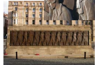
Conserved bronze panel from Tyson Smiths War Memorial (1946)