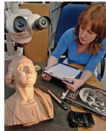
Initial investigations and recording of artefacts

Conservation Technologies' resident team of conservators and scientists have extensive experience in analyzing and handling objects in a wide range of materials including marble, stone, terracotta, ceramics, bronze, plaster and wax.